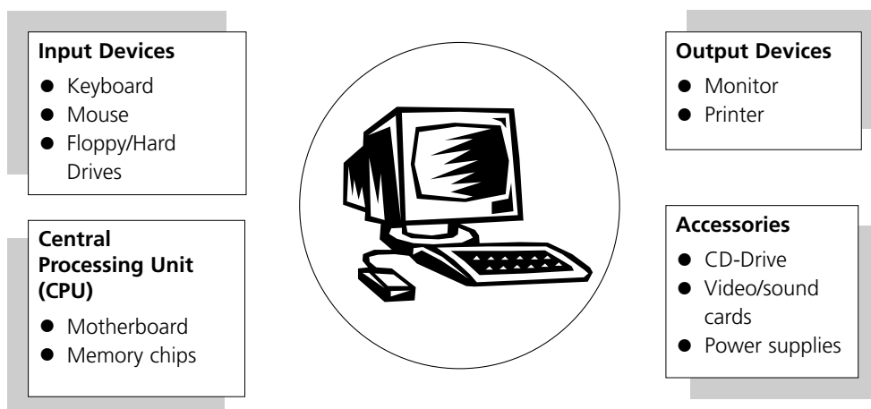
Figure 1. The personal computer

The availability of cheap personal computers has undoubtedly had positive effects. First, it has provided hundreds of thousands of jobs around the world. Second, easy access to computers in the North has provided various social goods, including better communication between communities, educational opportunities and increased efficiency.